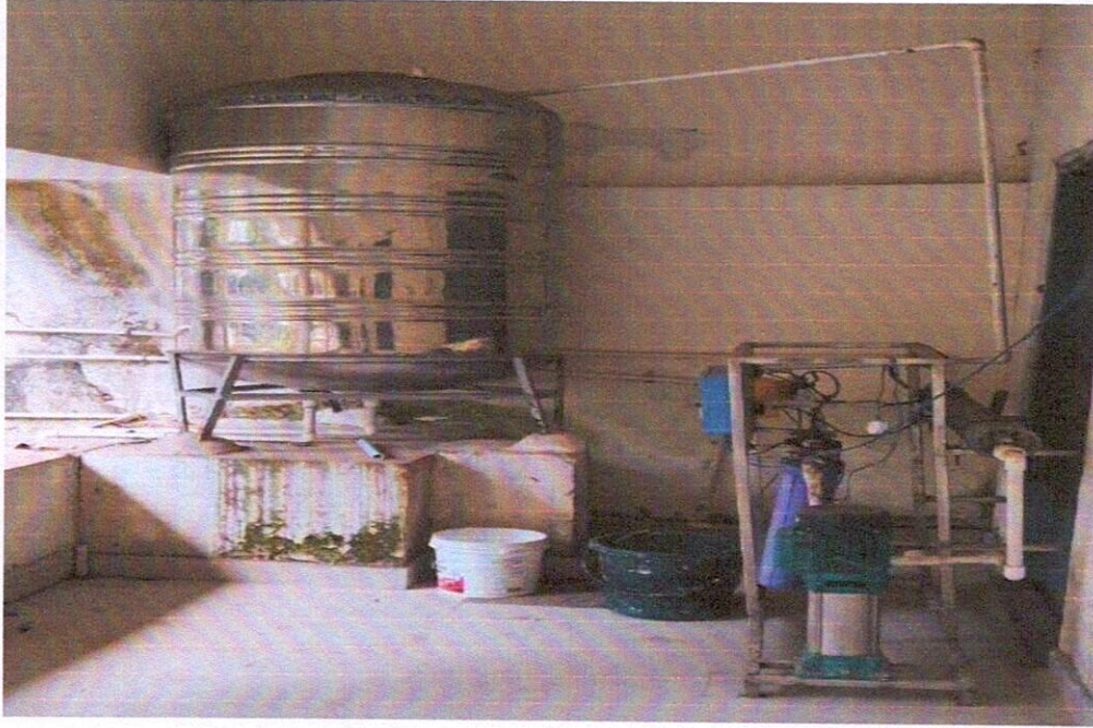
Mineral water plant