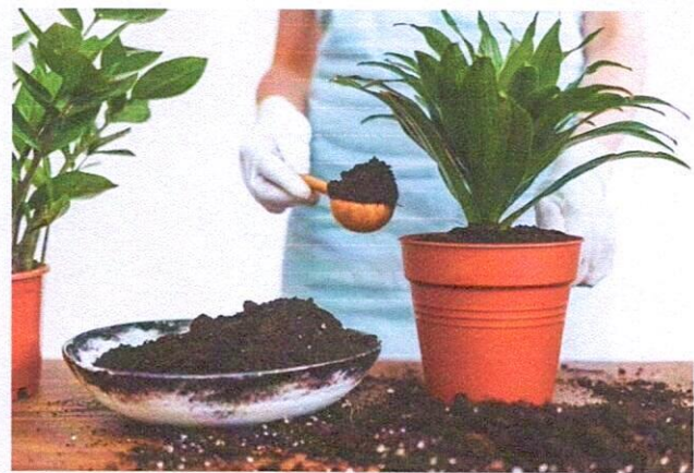
Vermicompost used as nourishment for Plant Growth