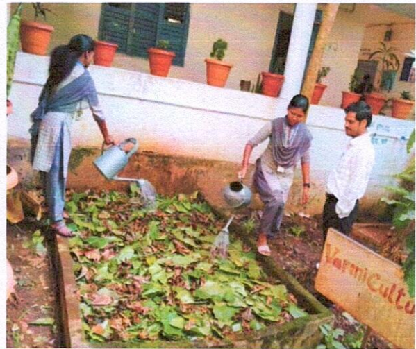
Using the Degradable waste in the synthesis of Vermicompost in the Vermiculture pit