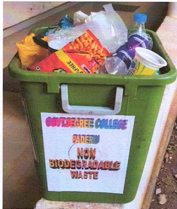
Collecting the Degradable and Non degradable waste from College premises